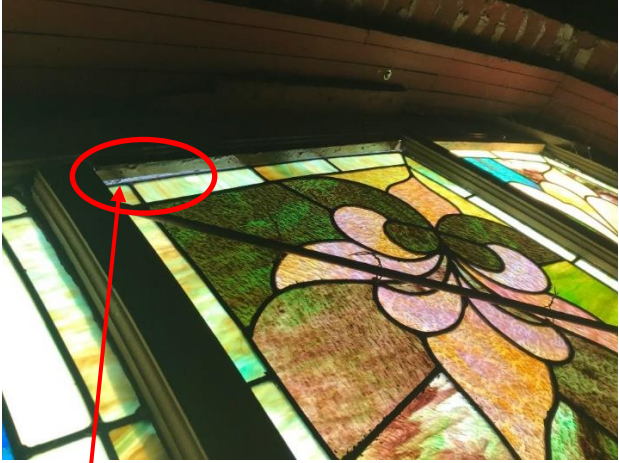
Gap between glass and frame

The list and cost of each window restoration is: Window Window Cost Cost 1 North Tower, Low 10 South Tower, Low $4,250 $4,250 2 Sanctuary, North Wall, Right $6,710 11 South Tower, East Wall, Low $4,250 3 Sanctuary, North Wall, 2<sup>nd</sup> 12 Small above front door Sponsored $6,710 4 Sanctuary, North Wall, 3<sup>rd</sup> Sponsored 13 North Tower, East Wall, Low $4,250 5 Sanctuary, North Wall, Left $6,710 14 South Tower, South Wall, High $7.250 6 Sanctuary, South Wall, Right Sponsored 15 South Tower, East Wall, High $7,250 7 Sanctuary, South Wall, 2<sup>nd</sup> Sponsored 16 Large, above front door $12,250 8 Sanctuary, South Wall, 3<sup>rd</sup> Sponsored 17 North Tower, East Wall, High $4,000 9 Sanctuary, South Wall, Left $6,710 18 North Tower, North Wall, High $4,000