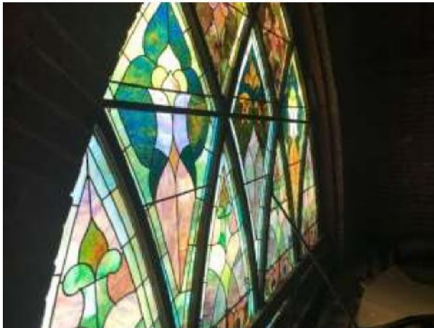
Large East Window

Update: So far, 31% ($33,575 of $109,430 total project costs) has been donated to the stained-glass window restoration fund. The trustees asked the church board to approve a capital fund drive to obtain pledges for 50% of the project cost before proceeding with the restoration.