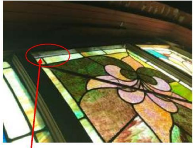
Gap between glass and frame

Please consider pledging a regular gift to the stained-glass window project or sponsoring the total cost of restoring a window. A memorial plaque recognizing the sponsor of the window will be added if desired. Please let David Jay (937) 698-6412 know which window you want to sponsor. The list and cost of each window restoration is: